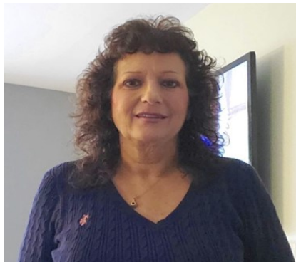
Commissioner Catherine Bernard-Dutton