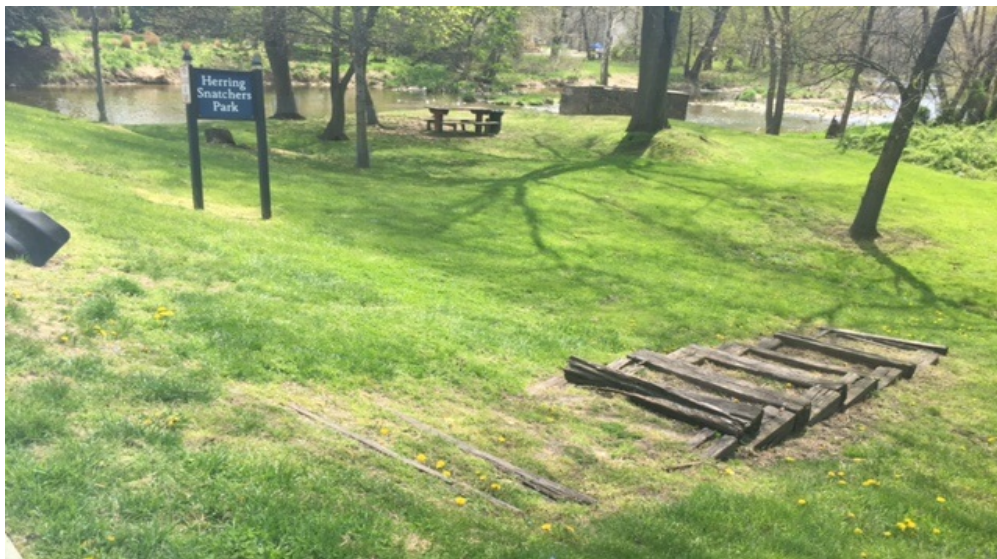
Herring Snatchers Park