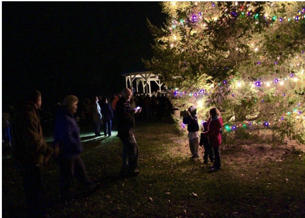
2016 Christmas Tree Lighting at the North East Community Park