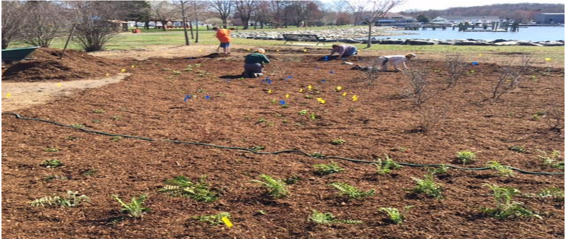
Rain Garden 1: Master Gardener volunteers installing the plantings and mulch