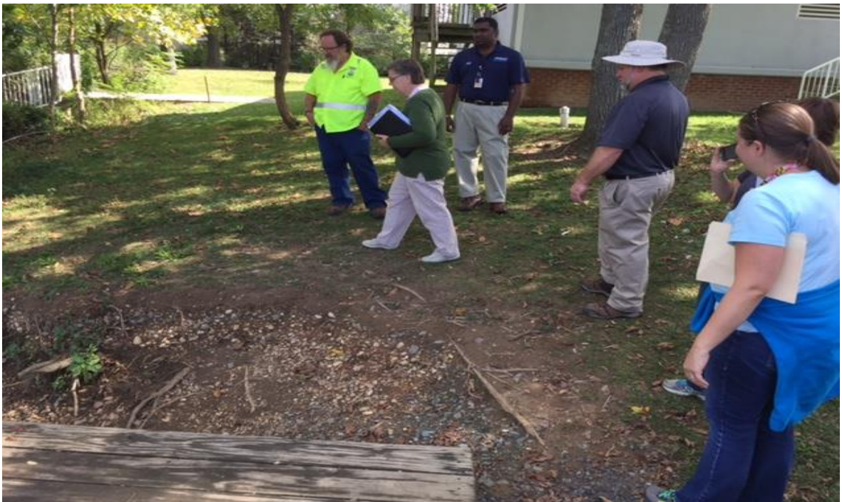
Meeting at the North East Community Park September 2016