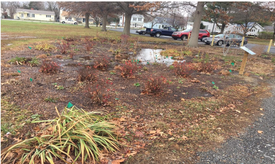
Rain Garden 2 – Photo taken after two days of heavy rain