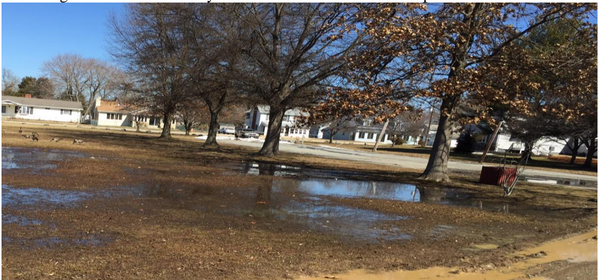
Rain Garden 2 Site: Stormwater problems are evident prior to the rain garden installation