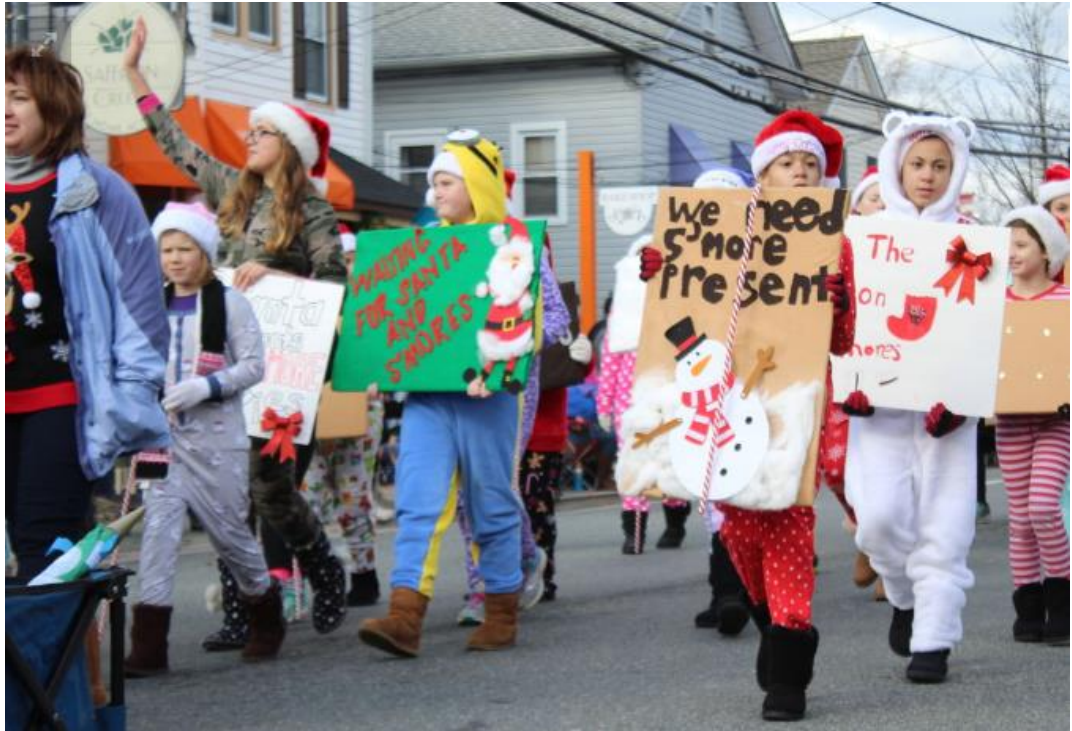
2016 Cecil County Christmas Parade