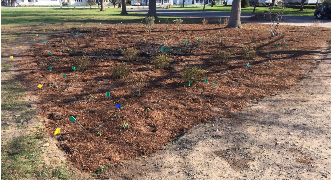
Rain Garden 2: Completed