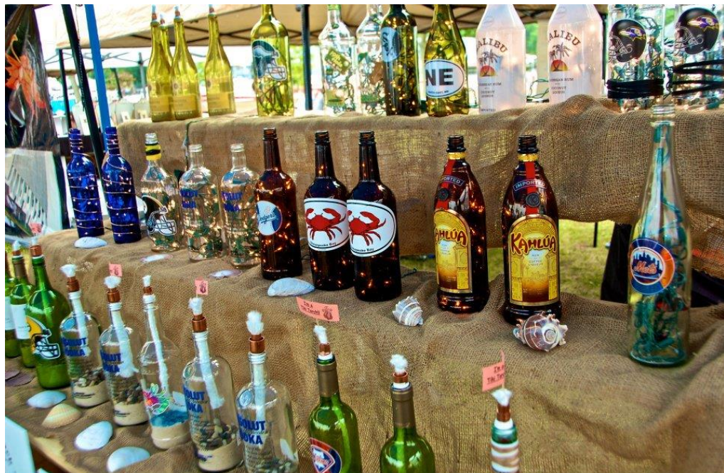
2016 Cecil County Food and Wine Festival to benefit the Cecil County Boys and Girls Club