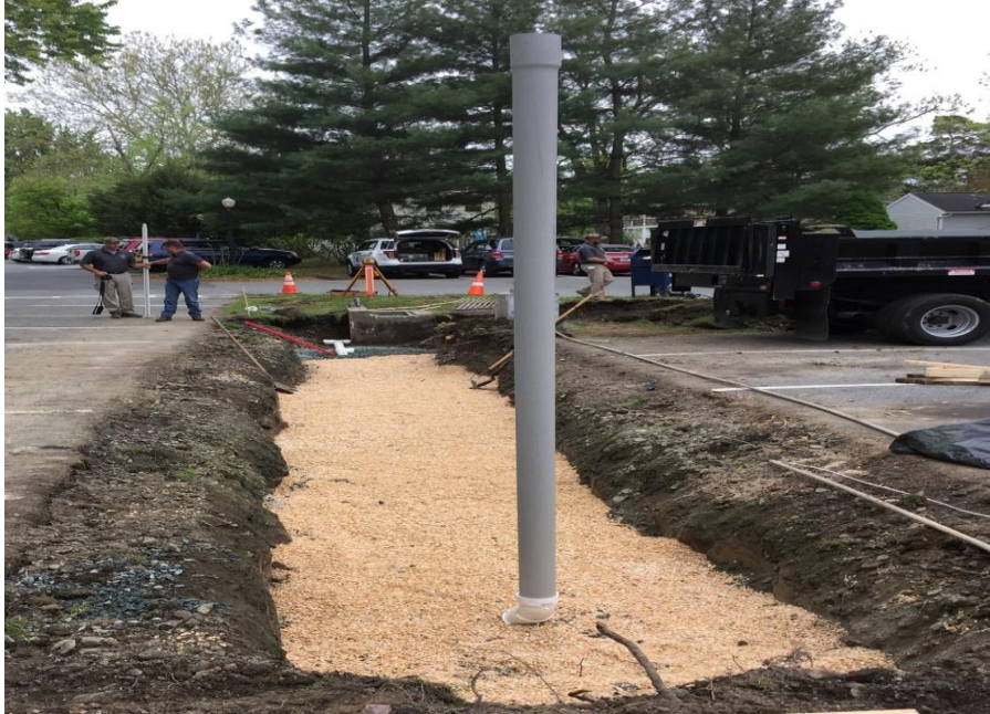
Rain Garden, Town of North East Municipal Parking Lot