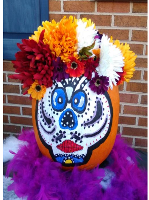
Pumpkin Decorating Contest