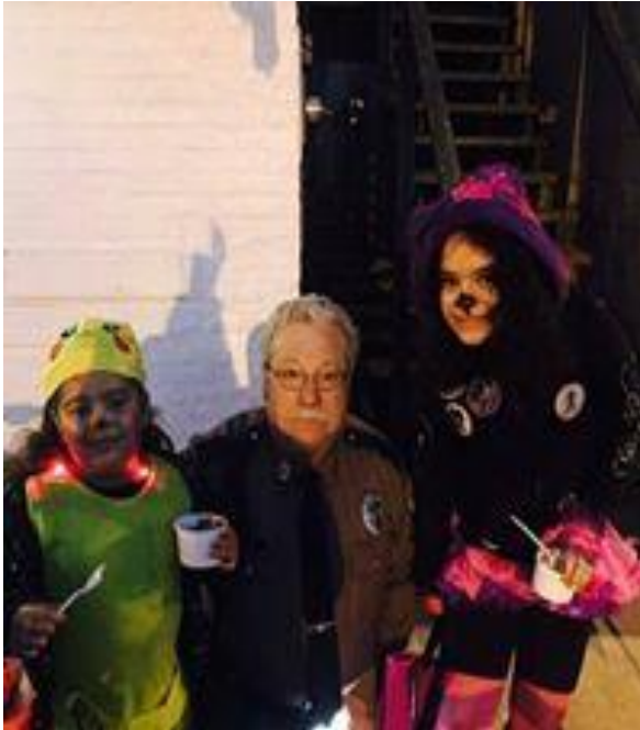
Trick or Treating