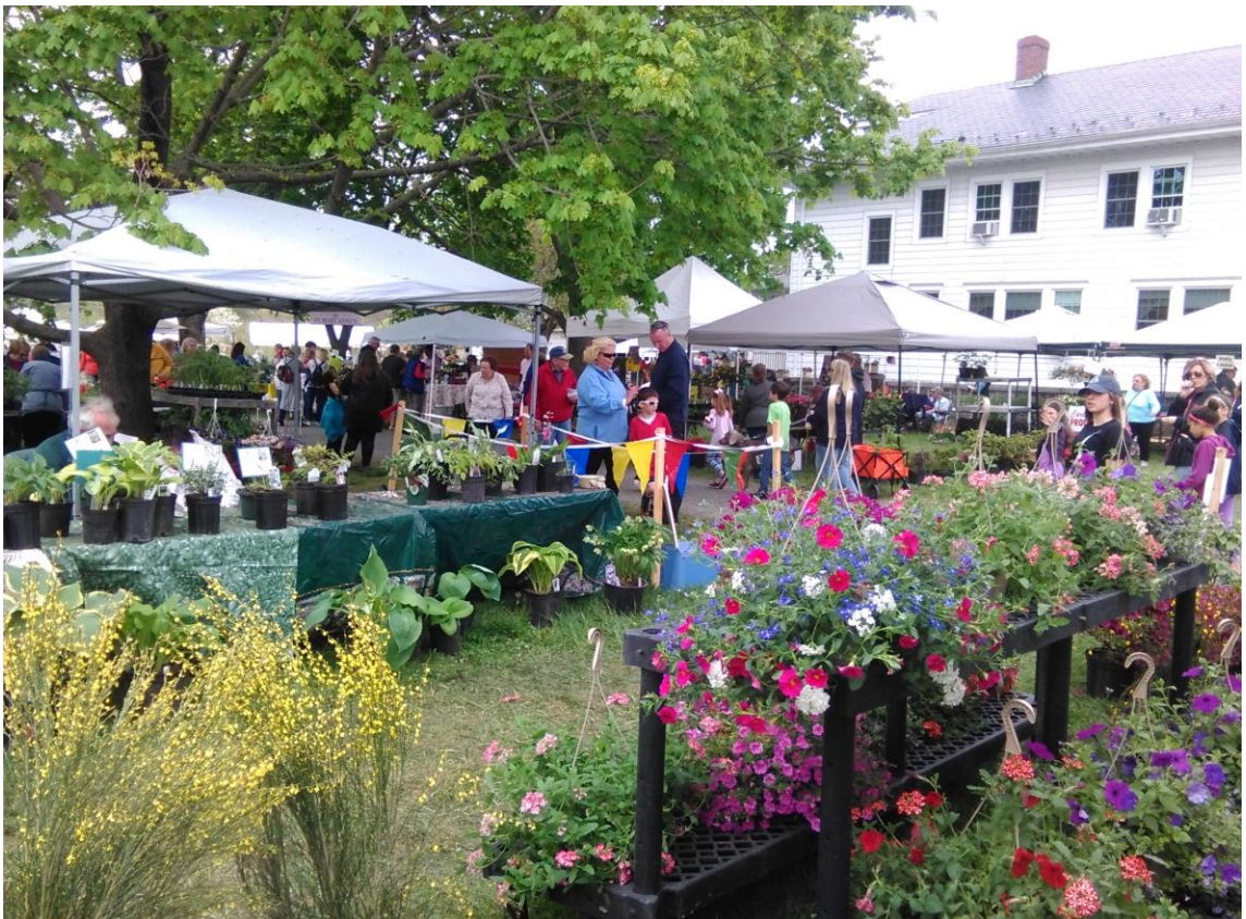
St. Mary Anne's Garden Market

In 2016, events in the Town of North East included the Annual Easter Egg Hunt, the 18 th Annual St. Mary Anne's Garden Market, the 29 th Annual Mid-Atlantic Chevelle Show & Swap Meet, the Salute to Cecil County Veteran's fireworks show, 2016 Wine and Food Festival, the Cecil County Public Library Crab Crawl, Mutts Masquerade, Pumpkin Decorating, Trick or Treating on Main Street, Holiday Window Decorating Contest, the Annual Town of North East Tree Lighting Ceremony, the Santa House, Holiday House Decorating Contest and the Annual Cecil County Christmas Parade, as well as various other events and activities held throughout the year within the Town of North East.