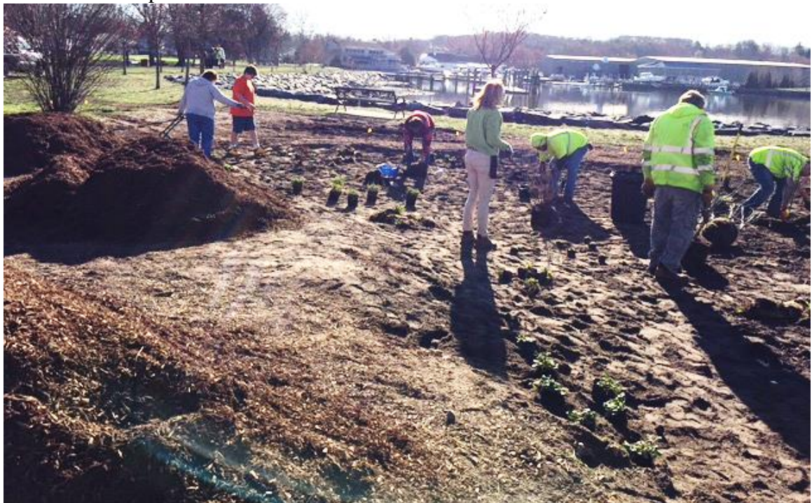
Rain Garden 1: Site is adjacent to the Jackson House at the North East Community Park