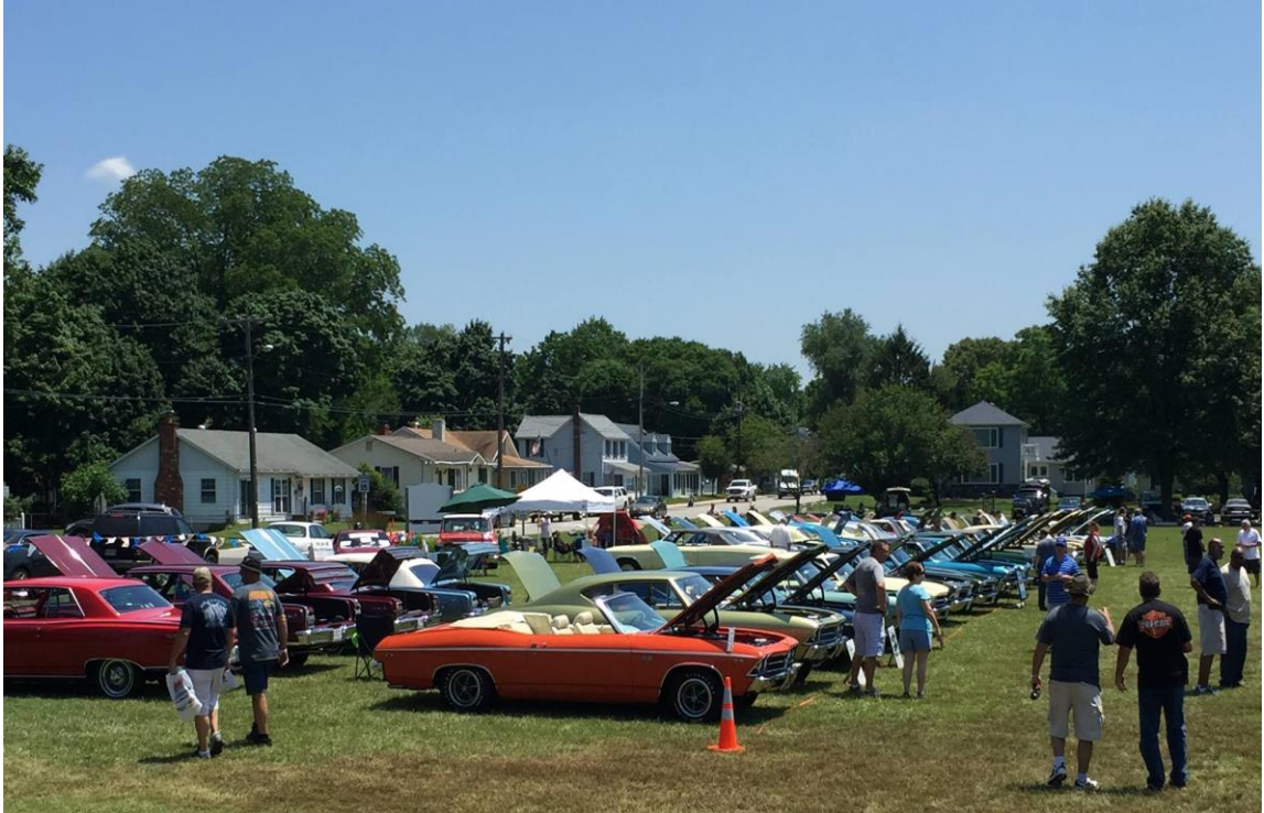
29th Annual Mid-Atlantic Chevelle Car Show & Swap Meet